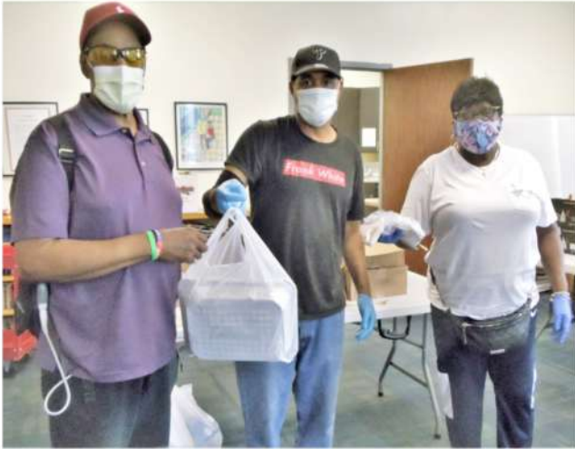
Members of the Salt and Light Congregation ready food parcels distributed weekly at The Common Place at 58th and Chester. Addressing endemic food insecurity is just one of the services at TCP which will now be better safeguarded through a PA state grant just announced.